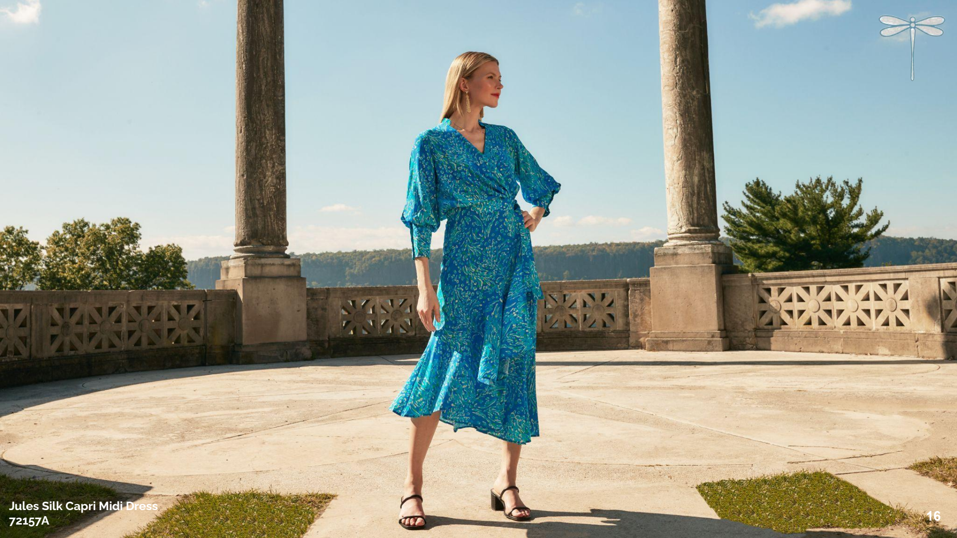
Jules Silk Capri Midi Dress 72157A