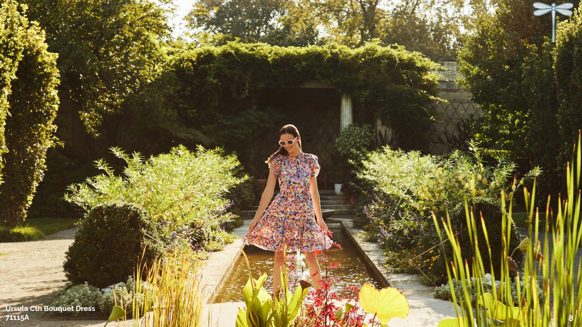
Ursula Ctn Bouquet Dress 71115A