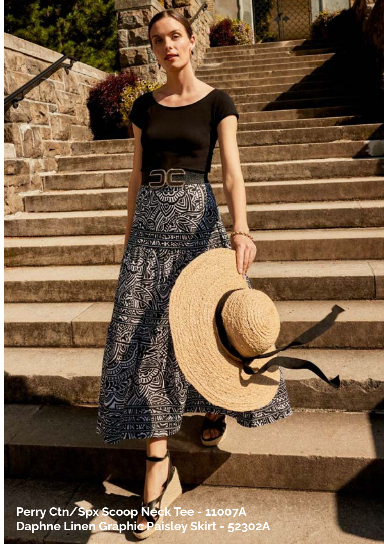
Perry Ctn/Spx Scoop Neck Tee - 11007A Daphne Linen Graphic Paisley Skirt - 52302A