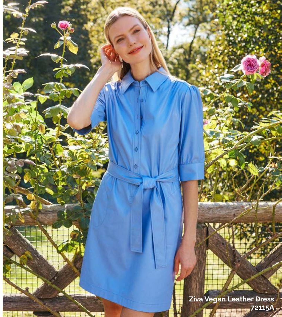
Ziva Vegan Leather Dress 72115A