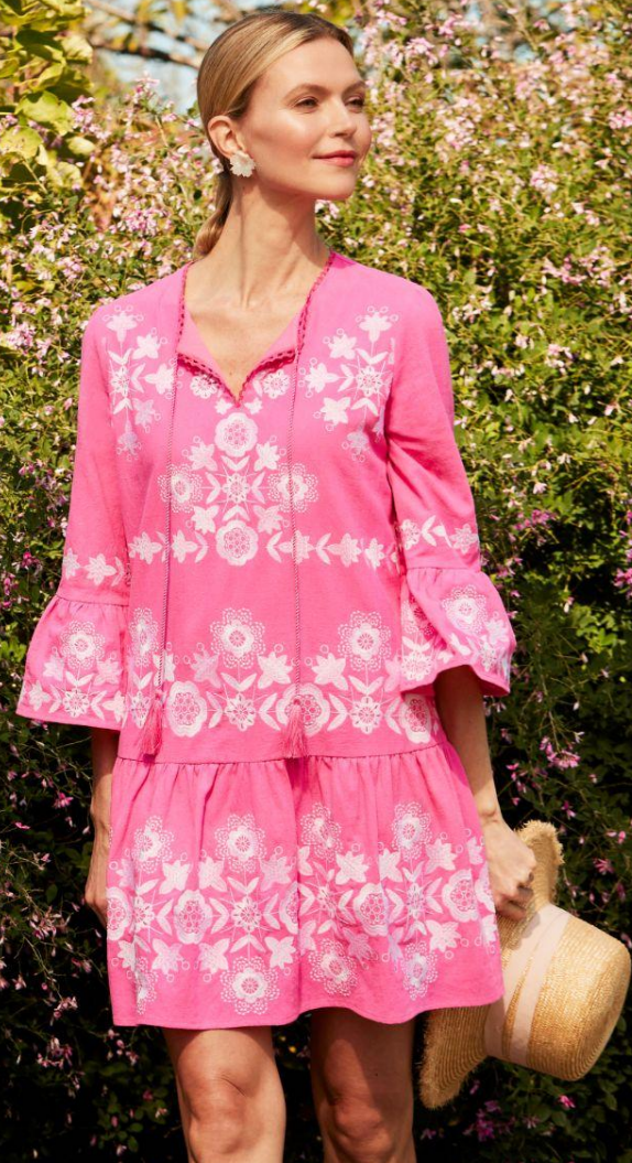
Holly Ctn Embroidered Skimmer Dress 32317A