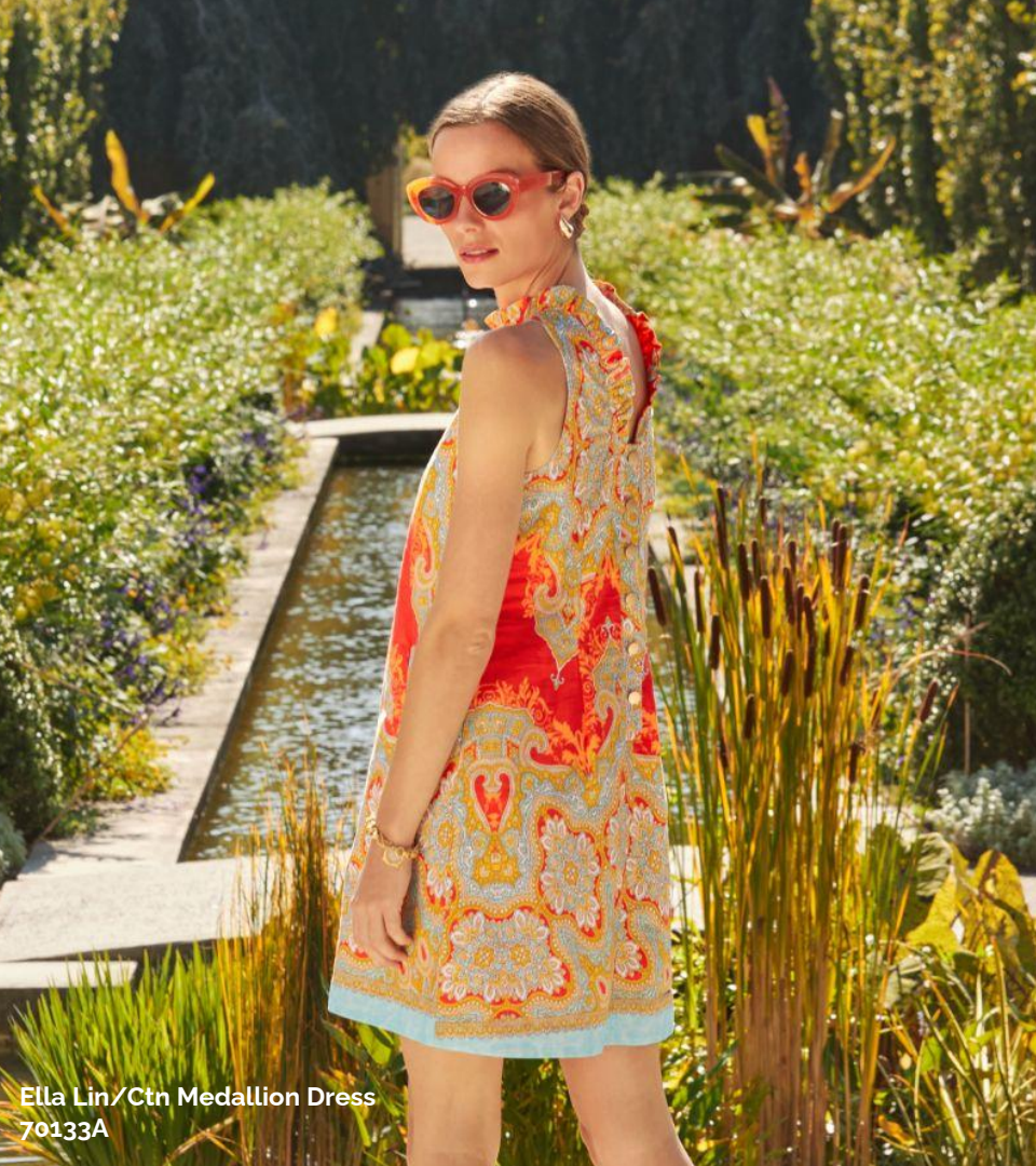
Ella Lin/Ctn Medallion Dress 70133A