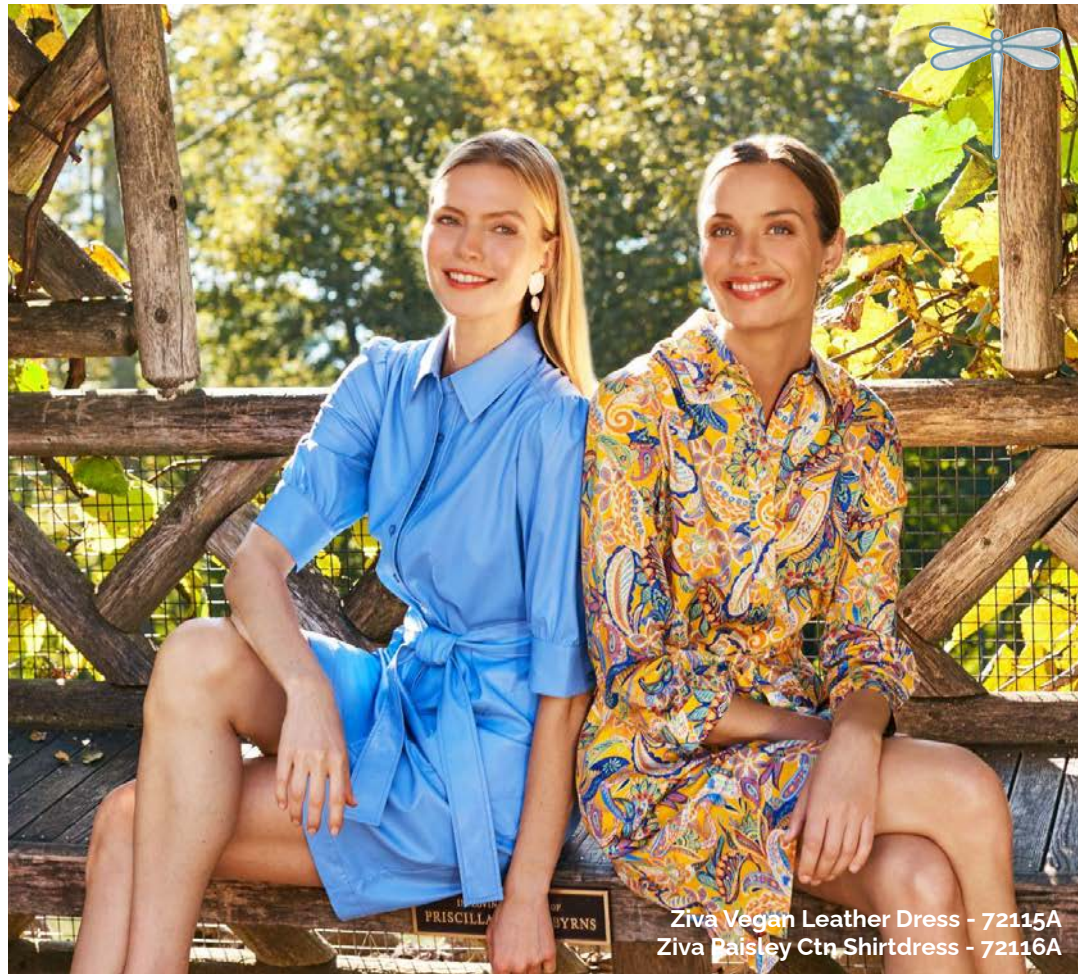
Ziva Vegan Leather Dress - 72115A Ziva Paisley Ctn Shirtdress - 72116A