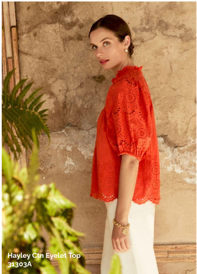
Hayley Ctn Eyelet Top 31303A