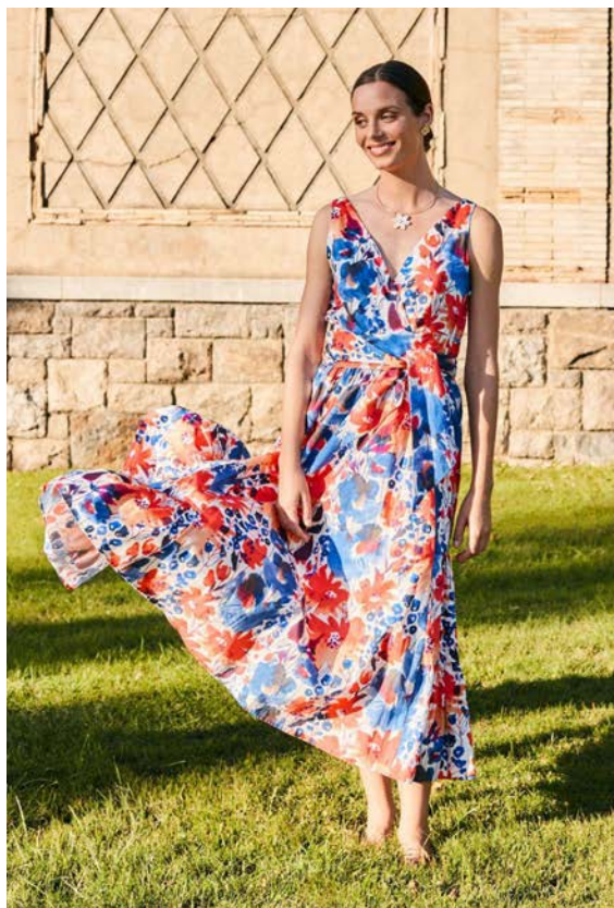
Yvette Ctn Crossover Maxi Dress 70143A