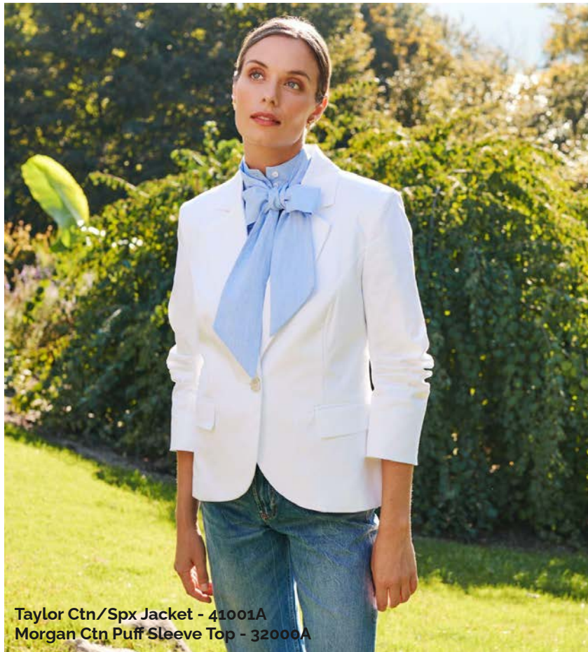
Taylor Ctn/Spx Jacket - 41001A Morgan Ctn Puff Sleeve Top - 32000A