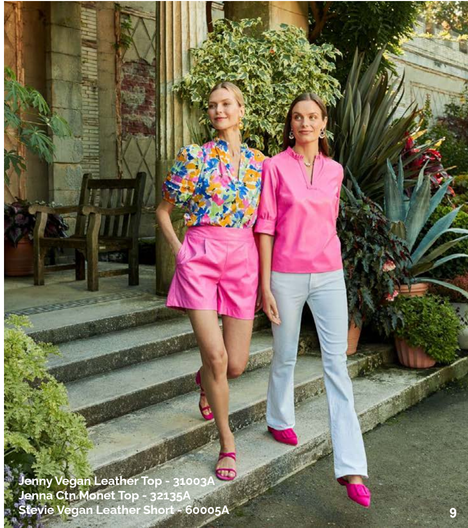
Jenny Vegan Leather Top - 31003A Jenna Ctn Monet Top - 32135A Stevie Vegan Leather Short - 60005A