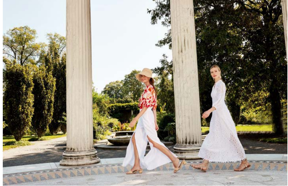
Margarita Linen Painterly Floral Top - 31120A Linen Slit Front Pant - 51001A Sondra Eyelet Midi Dress - 72303A